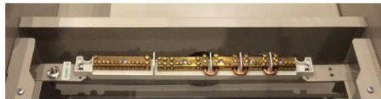
Earth & Neutral assembly bars