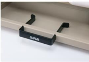
Sliding bracket for temporary power leads