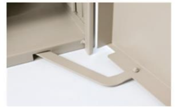
Door retaining strap