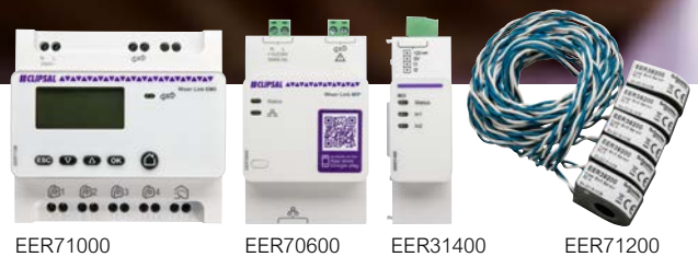
Solution connecting you to your switchboard